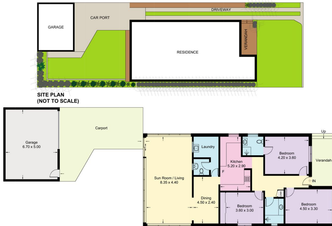
Illustration for identification purposes only, measurements are approximate, not to scale. floorplansUsketch.com © (ID640295)

Approximate Gross Internal Area = 138.1 sq m / 1486 sq ft Garage = 33.5 sq m / 360 sq ft Total = 171.6 sq m / 1846 sq ft